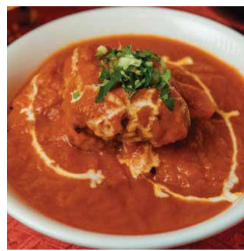
D. CURRY FISH 串燒魚