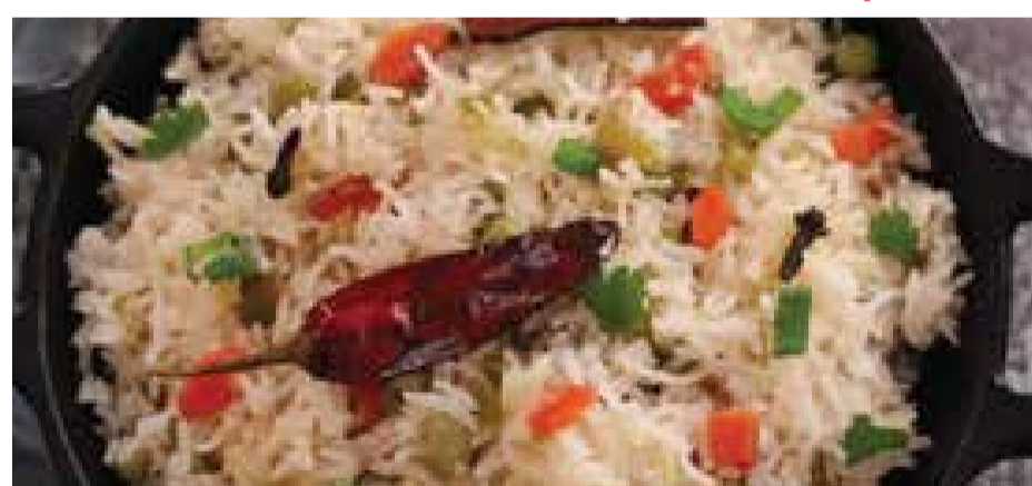
PULAO RICE 印度黃飯 $15