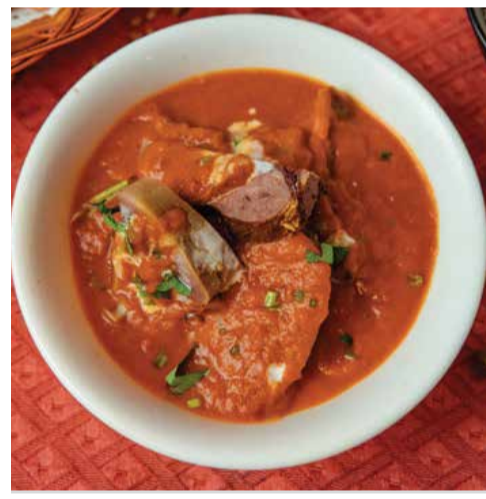
G. TONGUE CURRY 咖喱牛舌