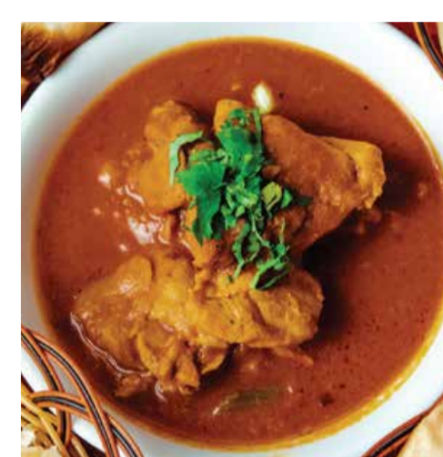
C. CURRY CHICKEN 咖喱雞