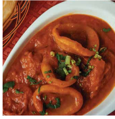
J. SQUID CURRY 咖喱魷魚