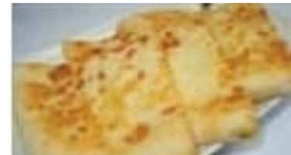
CHEESE NAAN 芝士烤餅 $20