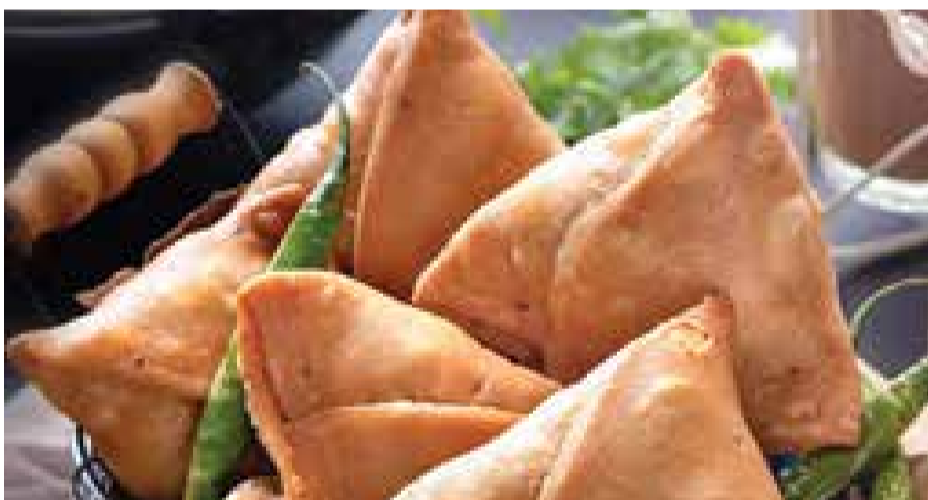
SAMOSA (2pc) 什菜咖角 $20