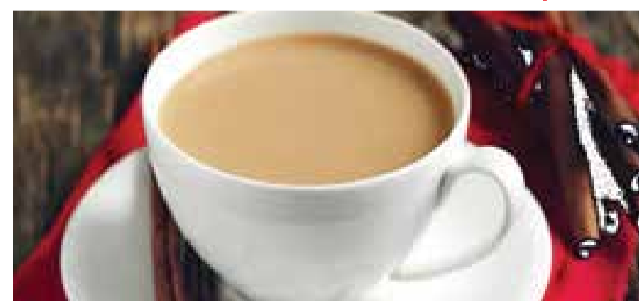
MASALA TEA 印度奶茶 $12