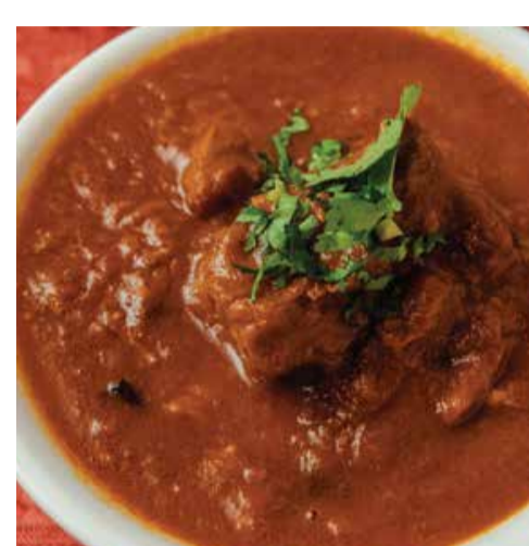
B. DAL MAKHANI 特式扁豆