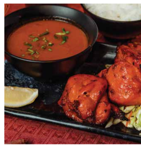
E. CHICKEN TIKKA (3PCS) & CURRY SAUCE 串燒雞(3件)配咖喱汁