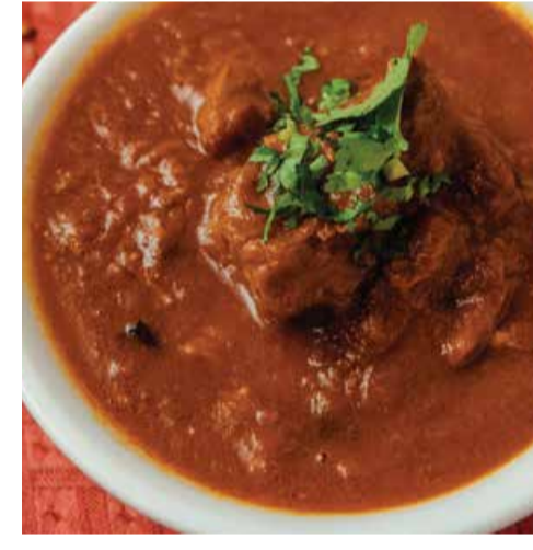
L. MUTTON CURRY RIBS 咖喱羊肉