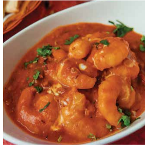
K. PRAWN CURRY 咖喱大蝦