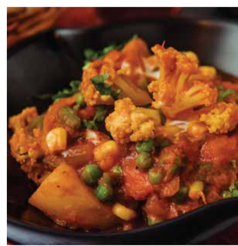
A. TOMATO VEGETABLE CURRY 蕃茄汁咖喱雜菜