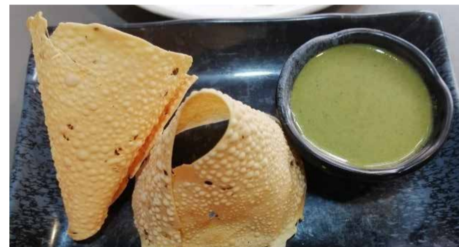
PAPADAM 威化胡椒餅 $10