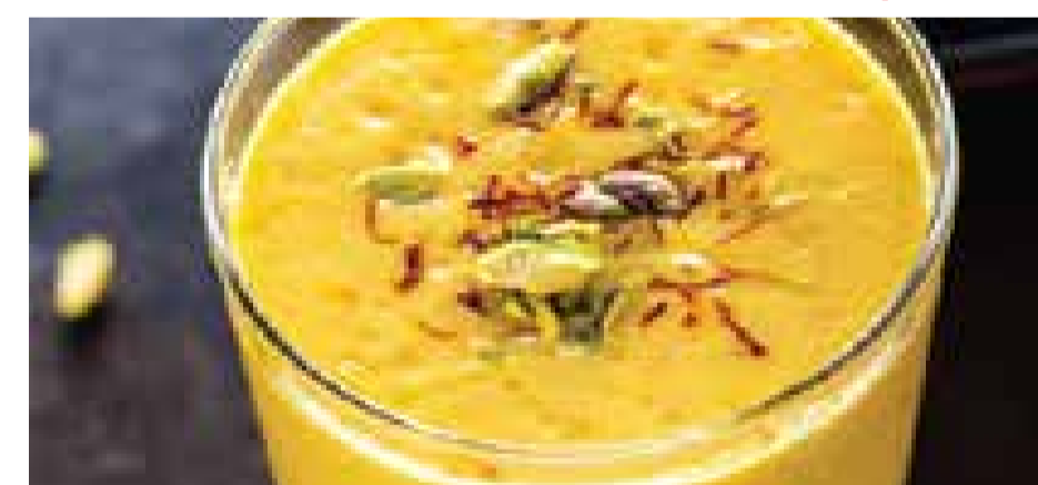
MANGO LESSI 芒果奶昔 $15