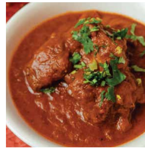
I. TANDOORI CHICKEN MASALA 馬薩拉唐杜里雞