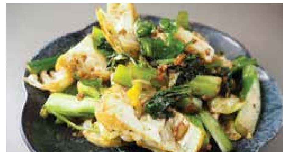
FRIED VEGETABLE 蒜蓉炒什菜 $38