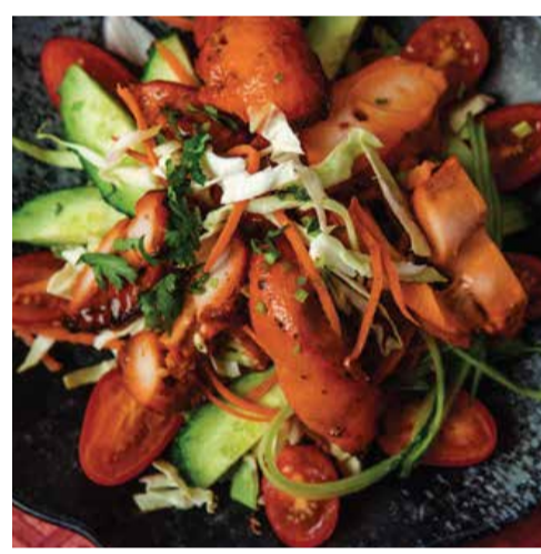
H. CHICKEN TIKKA SALAD 燒雞沙律