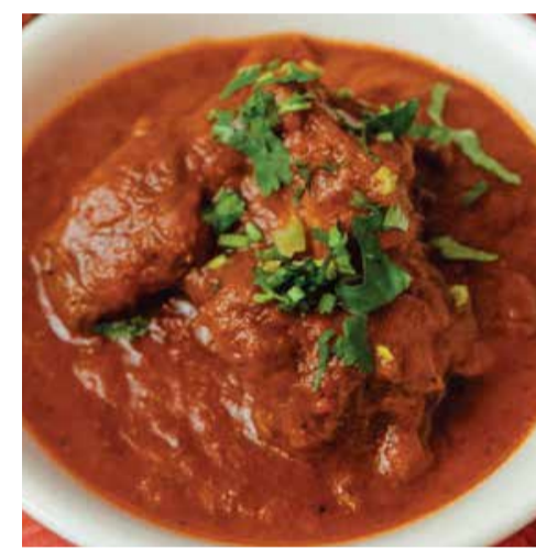
F. BEEF CURRY 咖喱牛腩