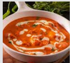
37. PRAWN MAKHANI $98 香濃茄汁燴蝦球

Prawns sauted with capsicum, onion and tomatoes.