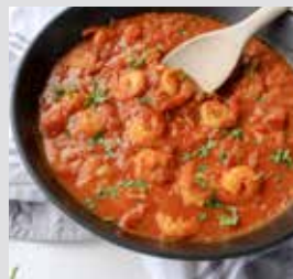
36. BHUNA PRAWN $98 香炒大蝦

Prawns sauted with capsicum, onion and tomatoes.