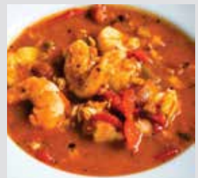
40. MIXED SEAFOOD CURRY $118 勁辣雜錦咖喱海鮮

Selected mixed seafood cooked with herbs and spices.