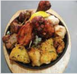
25. TANDOORI MIXED GRILL $158 鐵板什錦燒燒烤

Combination of chicken tandoori, lamb kebab, garlic chicken kebab and fish tikka.