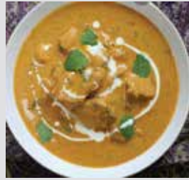
34. TONGUE KORMA $78 腰果濃汁牛脷