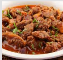
28. BEEF CURRY $82 咖喱牛腩