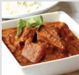
39. FISH VINDALOO $80 勁辣咖喱魚

Fish cooked in mildly spices curry sauce.