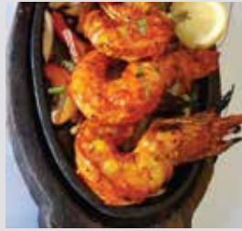
26. TANDOORI KING $168 PRAWN 鐵板大明蝦

Combination of chicken tandoori, lamb kebab, garlic chicken kebab and fish tikka.