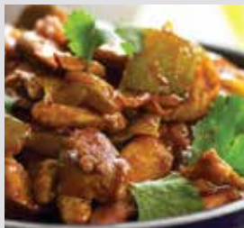
30. BEEF BHUNA $85 特式牛腩