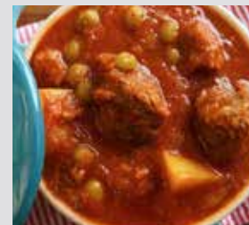
29. BEEF TOMATO $85 CURRY 蕃茄汁牛腩