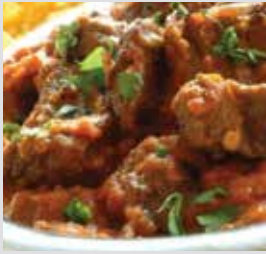
33. TONGUE CURRY $78 咖喱牛脷