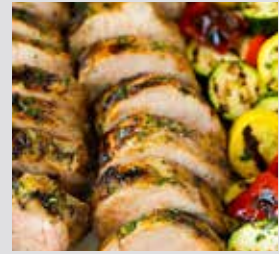
27. TANDOORI OX TONGUE $85 烤爐牛脷

On tandoor cooked with extra spice and grilled in tandoor.