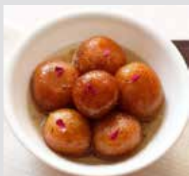
89. GULAB JAMUN $25 糖水甜煎堆