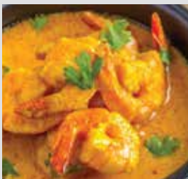
35. PRAWN CURRY $98 咖喱燴鮮蝦