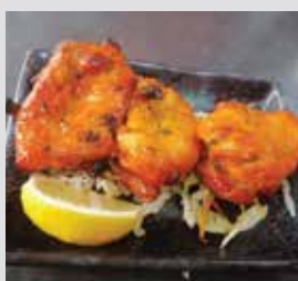
91. Q TANDOORI $48 CHICKEN TIKKA Q 串燒雞