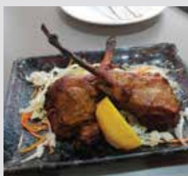
94. Q TANDOORI $88 LAMB CHOPS Q 板烤羊鞍扒