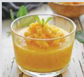
90. MANGO PUDDING $20 芒果布丁