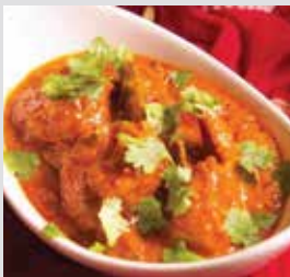
38. FISH CURRY $80 椰汁咖喱魚

Prawns in a unique blend of tomato sauce with honey and lemon.