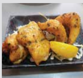
92. Q TANDOORI $48 SOLE FISH Q 炭燒無骨魚