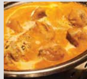
32. BEEF KORMA $82 腰果濃汁牛腩

ALL CURRIES ARE SERVED WITH RICE/NAN 所有咖喱都配米飯/南