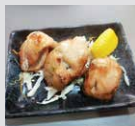
93. Q TANDOORI $48 GARLIC KEBAB Q 烤蒜子雞件