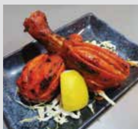
95. Q TANDOORI $48 CHICKEN Q 香燒雞