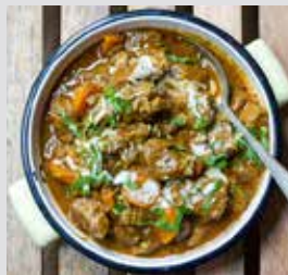
31. BEEF COCONUT $85 BHUNA 椰汁咖喱牛腩